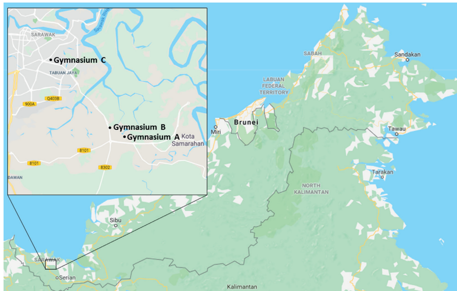
FIGURE 1: A map of gymnasiums involved in this study. Gymnasiums A and B were located in Kota Samarahan, while gymnasium C was located at BDC in Kuching.

that of MSSA [25] which should receive attention by the public and owners. Circulation of S. aureus in the gymnasium area was also reported by Cohen [26] where three weight lifters from the University of Houston were infected with MRSA, who eventually recovered after several treatments which were incision and drainage, sensitivity-directed antibiotic therapy, topical mupirocin, and cleansing with an antibacterial agent (povidone-iodine or chlorhexidine). Other pathogens can also be isolated from gymnasium equipment such as in a study by Goldhammer et al. [24] that found diphtheroids, Gram-positive cocci, Bacillus species, coagulase-negative staphylococci, Micrococcus species, and culturable virus from two fitness centres.