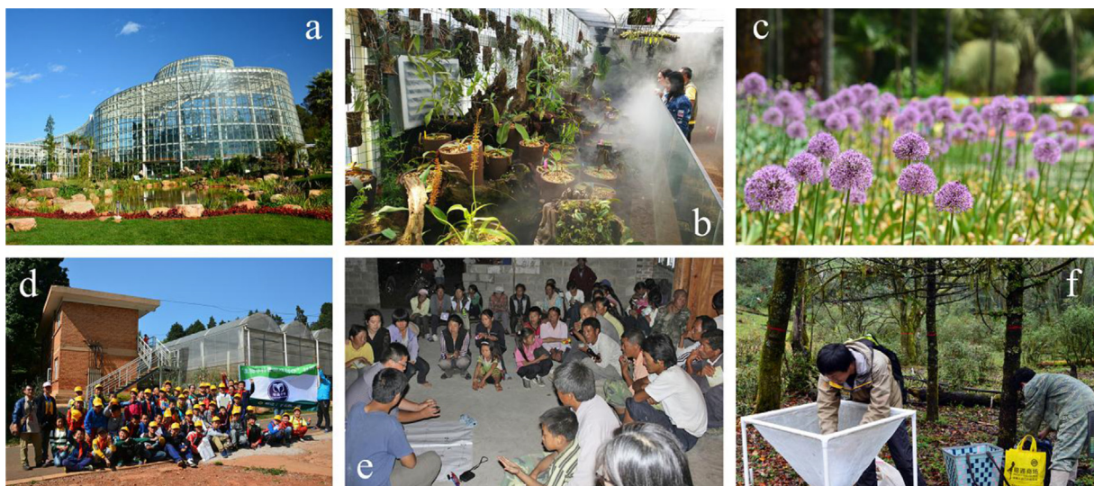
Fig. 3. Citizen science and public education: a) Greenhouse of KBG; b) Pitcher plant Garden; c) Allium Garden; d) Public education involved local primary school students; e & f) Local residents involved scientific research with staffs from KBG.

research, public education, and conservation, in addition to harboring greenhouses that support integrated in situ and ex situ conservation in the area (Blackmore et al., 2011). The primary purpose of the Jade Dragon Field Station is the conservation of