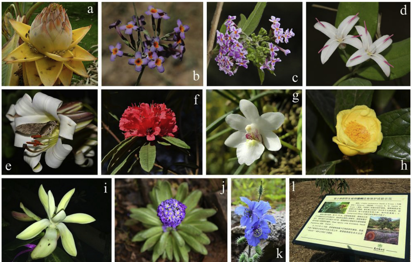
Fig. 2. Some representative plant species conserved in KBG: a) Musella lasiocarpa ; b & c) Buddleja delavayi and its mutant; d) Stemona mairei ; e) Lilium sargentiae ; f) Rhododendron delavayi ; g) Holcoglossum rupestre ; h) Camellia nitidissima ; i) Manglietiastrum sinicum ; j) Primula denticulate ; k) Meconopsis racemose ; l) Plant Species with Extreme Small Populations garden in KBG.