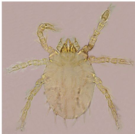
Fig. 1. Larva of Leptotrombidium deliense (10 \times 20).