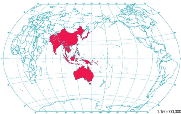
Fig. 4. Geographical distribution of Leptotrombidium deliense and scrub typhus.

The investigation from Yunnan province in Southwest China revealed both species composition and dominant species of chigger mites differed in different geographic regions and habitats. Nonetheless, L. deliense was the dominant species of chigger mites in some places of Yunnan, especially in some flatlands and valleys along rivers with low altitude, hot and humid weather [2,41,42]. As one species of chigger mites in the family Trombiculidae, Leptotrombidium deliense has been proved to be the main vector of scrub typhus in many parts of Southeast Asia where scrub typhus, caused by the agent of O. tsutsugamushi infection, is the second common febrile disease next to malaria. In recent years, scrub typhus has been the most common re-emerging rickettsial infection in India and many countries in Southeast Asia [46]. There have been several