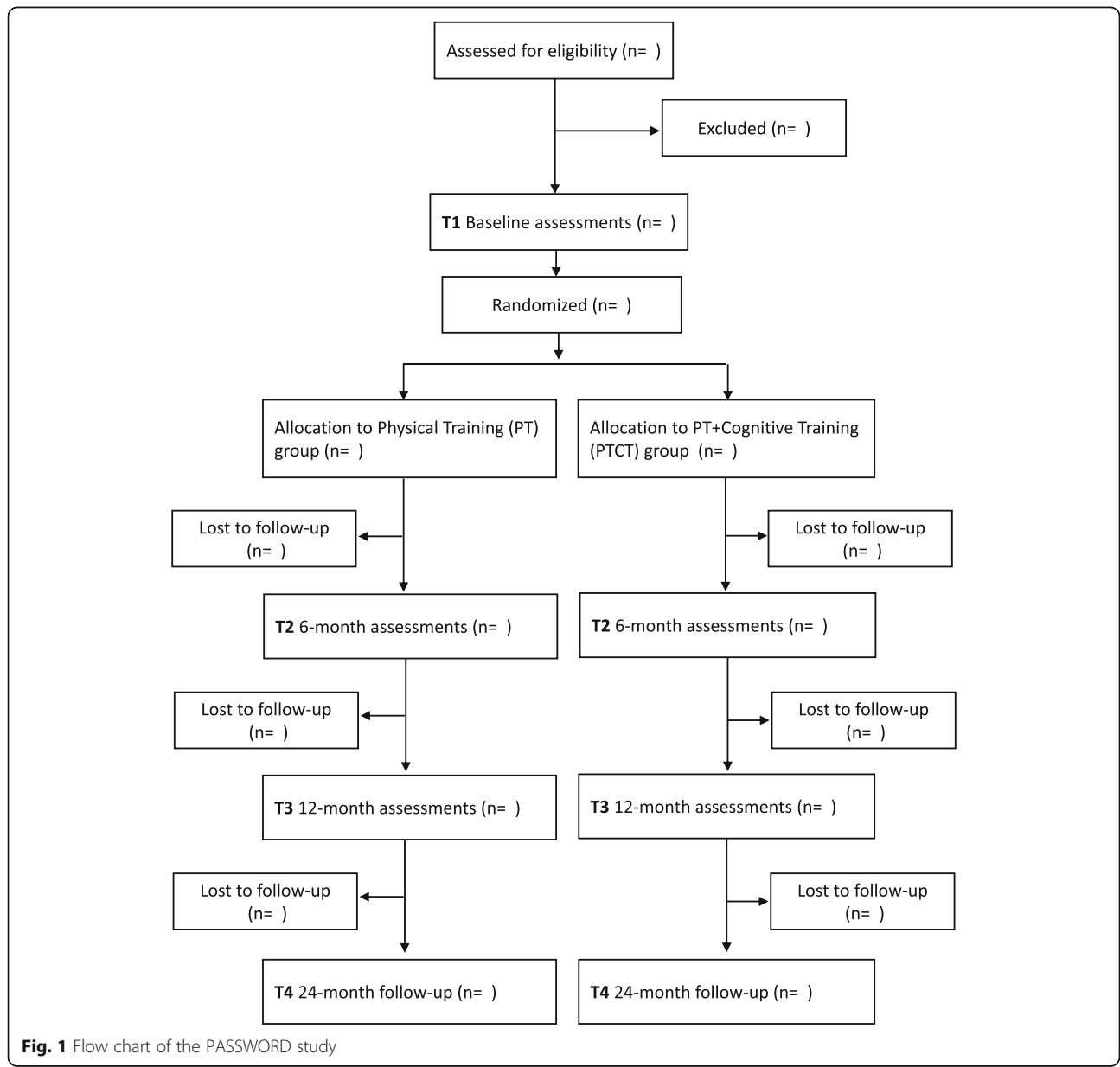
Fig. 1 Flow chart of the PASSWORD study

Secondary outcomes are 6-min walking distance, dual-task cost in walking speed, fall incidence and executive function. In the 6-min walking test, participants are encouraged to walk up and down a 20-m circuit for