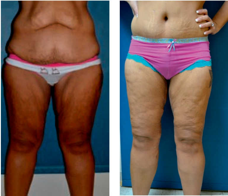
Figure 4 Thigh Lift: Before (left) and after (right).

located near the groin or diffusely down the entire thigh. Essentially, a wedge of skin and fat is removed full thickness from the medial thigh. The concept is similar to a brachioplasty. The incision extends proximally in the groin or gluteal crease and distally to the knee as needed to remove dog ears and produce a satisfactory contour. The procedure is done with the patient in lithotomy position and drains are incorporated. In the author's opinion, this procedure carries a higher risk for dehiscence, lymphedema and infection than other body contouring procedures. This is likely secondary to the greater adiposity in this region, the dependent edema that occurs and the mobility of the tissues as an ambulatory structure. 20 (See Figure 4.)