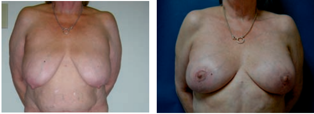
Figure 2 Augmentation - Mastopexy: Before (left) and after (right).

having an implant or by the use of autologous fat which has been suctioned from another area. Techniques of auto-augmentation with derma-glandular flaps, that would normally be resected during mastopexy, have been described with mixed results. 13 An augmentation-mastopexy may be done in one or two stages depending on the size of the implant desired, surgeon experience, patient co-morbidities, and expectations. (See Figure 2.) A small implant may be used in one stage whereas if a larger implant is needed, two stages are preferred since less skin can be removed in order to contour the breast. Moreover, combining mastopexy with augmentation reduces the vascularity of the tissue flap containing the NAC and may lead to delayed healing, implant infection and loss of the NAC. Furthermore, the position of the implant is difficult to control and asymmetries may result as there are several variables being addressed simultaneously. For most patients, two-stage mastopexy-augmentation surgeries are safer and reduce the need for revisions later. Drains are generally not needed in these procedures. 14