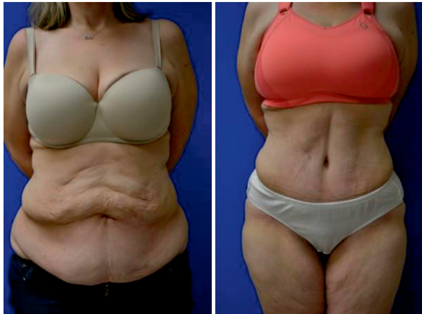
Figure 1 Abdominoplasty - Before (left) and after (right) of a patient who had massive weight loss surgery prior.

As the deformities of MWL are circumferential, many MWL patients require circumferential procedures. Patient with excess skin and/or fat in their lower back, lateral thighs and those with ptotic buttocks are candidates. Different approaches are offered based on the location and volume of the excess tissue to be removed. In these patients, the surgeon has to perform an abdominoplasty to treat the anterior trunk, remove posterior skin with or without lifting of the lateral thighs and buttocks. For example, a belt lipectomy results in a scar above the iliac crest and has the effect of “cinching” the torso. A lower body lift results