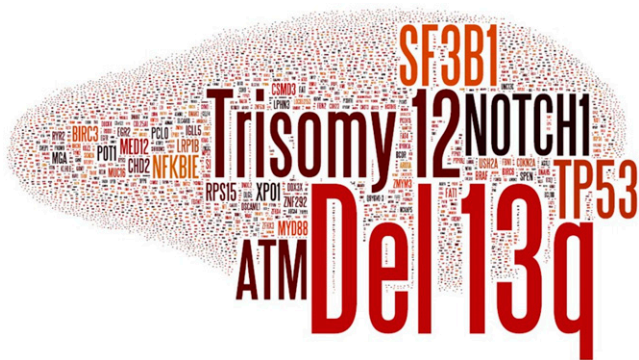
Figure 1. Genes and chromosomal regions affected by molecular lesions in CLL. The word cloud shows the genes that are reported as mutated in CLL by the Catalogue of Somatic Mutations in Cancer (COSMIC; v77) and the gross chromosomal abnormalities that are recurrent in CLL. The size of the font is proportional to the frequency of the molecular lesion.

although they should be more properly defined as kinase inhibitors because they inhibit many different pathways. Functional evidence indicates that BCR pathway activation in CLL results from contacts between tumor cells and antigens, which is influenced, among others, by the somatic hypermutation (SHM) load of the rearranged immunoglobulin heavy-chain variable ( IGHV ) genes. 7 CLLs carrying unmutated IGHV genes display enhanced BCR signaling compared with CLLs carrying mutated IGHV genes, reflecting functional differences in the type of antigenic interaction through the BCR. The BCRs of CLLs carrying unmutated IGHV genes maintain poly-reactivity because of the lack of SHM, and thus are capable of binding multiple epitopes and are more prone to sustained signaling. 7 Conversely, CLLs carrying mutated IGHV genes fail to respond to BCR stimulation because of anergy, or because the antigen specificity has