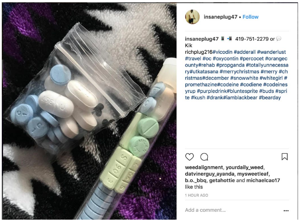
Figure 2. Screenshot from Instagram of Digital Drug Dealer Detected Using Machine Learning.

example, machine learning algorithms (both supervised and unsupervised) can accurately identify and classify illegal sales of opioids, registration of suspicious online seller accounts can be blocked, and Internet service providers can be forced to suspend or takedown illegally operating online pharmacy Web sites.<sup>4,15</sup>