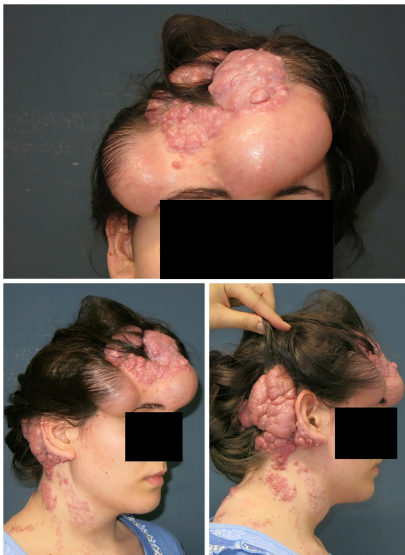
Fig. 3. Second surgical step. The patient was treated with two 100 ml rectangle tissue expanders on the scalp, which were completely expanded after 3 months.

Scalp reconstruction after tumor excision may include any of the following techniques: secondary or primary closure, advancement, rotational or transpositional flaps, tissue expansion, locoregional or free flaps, and split-thickness or full-thickness skin graft [15,19]. The choice depends on the anatomic side, patient-related factors, and experience of the operator.