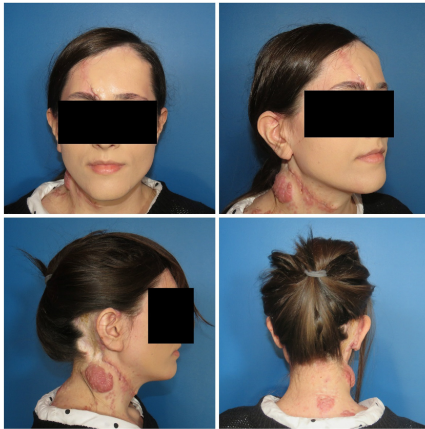
Fig. 4. After 6 years of constant follow-up, the patient showed excellent aesthetic and functional results without any recurrence or complications observed.

documentation, with benefit to patient quality of life and no recurrence. The correct preoperative planning and the various reconstructive techniques allowed us to achieve an excellent result in the absence of complications.