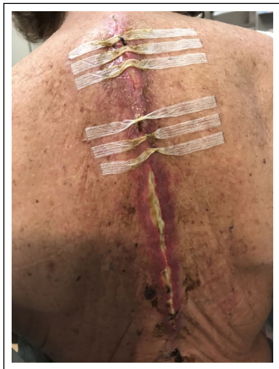
Figure 2. Wound complication after major posterior spine surgery.

specific fascial closure type following adult posterior midline spine surgery. In general, little data exists analyzing the fascial closure technique in other populations. Ward et al 21 retrospectively compared a nonstandardized closure technique ( n = 42 ) with a plastic surgery multilayered technique ( n = 34 ) in patients with adolescent nonidiopathic scoliosis. The wound complication rate in the nonstandardized closure group was significantly higher. Note that the multilayered technique was performed by a plastic surgeon and the nonstandardized closure technique was not further described. In a randomized trial, Trimbos et al 22 compared interrupted and continuous suture fascial closure in patients who underwent a midline laparotomy and found no difference in terms of wound infection or dehiscence. Prospective randomized controlled trials comparing various closure types would be optimal to determine the best closure method to minimize the risk of wound complications; however, given the relatively low number of such events, a high number of patients would need to be enrolled and such a study may not be feasible in practice.