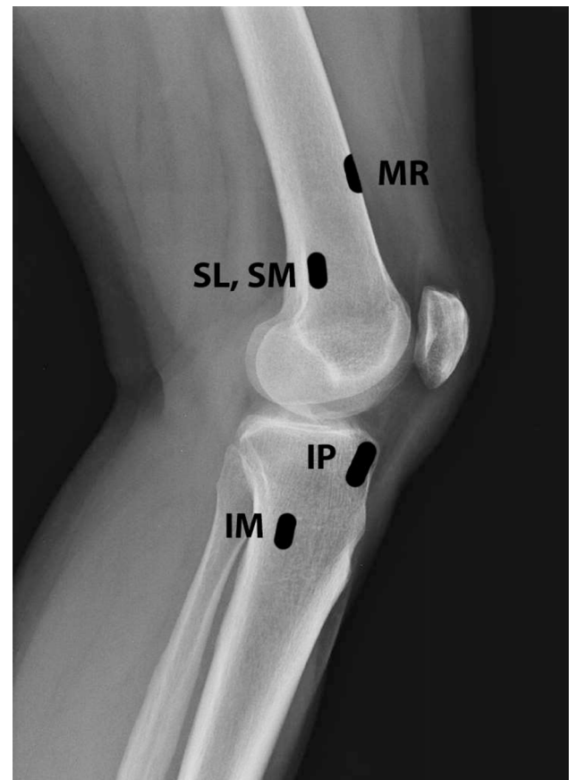
Figure 2 Lateral radiograph of the knee depicting locations for genicular nerve targeting.

Abbreviations: IM, inferomedial; IP, infrapatellar; MR, medial retinacular; SL, superolateral; SM, superomedial.