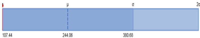
Fig. 3. \alpha -diversity of the data set. The min, max, and mean values along with the standard deviation ranges ( \sigma and 2\sigma ) in varying shades are shown. The \alpha -diversity of this metagenome dataset is shown in red. Alpha diversity sum up the diversity of organisms in a particular sample by a single number.