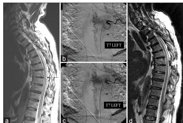
Figure 3: (a) Preoperative sagittal T2-weighted magnetic resonance image showing high intramedullary signal intensity, associated with subarachnoid serpiginous flow voids. (b and c) Preoperative selective spinal angiography revealing a dural arteriovenous fistula supplied by a left T7 radicular artery, as well as a tortuous and enlarged venous plexus, developing downward to the thoracic region. (d) Postoperative sagittal T2-weighted magnetic resonance image showing disappearance of abnormal venous dilatation and improvement of high intramedullary signal intensity