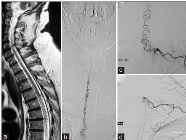
Figure 2: (a) Preoperative sagittal T2-weighted magnetic resonance image demonstrating high intramedullary signal intensity, associated with subarachnoid serpiginous flow voids hinting at the presence of a spinal dural arteriovenous fistula. (b and c) Preoperative selective spinal angiography revealing a dural arteriovenous fistula at the T8–T9 level, supplied by a left T8 radicular artery, as well as a tortuous and enlarged venous plexus, developing upward to the thoracic and cervical regions. (d) At 1-year postoperative follow-up, angiogram of the left T8 intercostal artery demonstrating complete disappearance of dural arteriovenous fistula

G-ALS – Aminoff–Logue Disability Scale for Gait; M-ALS – Aminoff–Logue Disability Scale for Micturition; G + M-ALS – Aminoff–Logue Disability Scale for Gait and Micturition