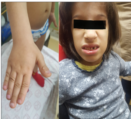
Figure 1: Patients appearance. This photograph presents facial dysmorphism including; a triangular face, pointed chin, sparse hair, nail hypoplasia, brachydactyly, crowded teeth and frontal bossing

In the 6 th month, she underwent another echocardiography again. This one presented that ASD and VSD have repaired spontaneously, but PDA had remained. Thus, she underwent surgical repair for her PDA when she was 8 months. As