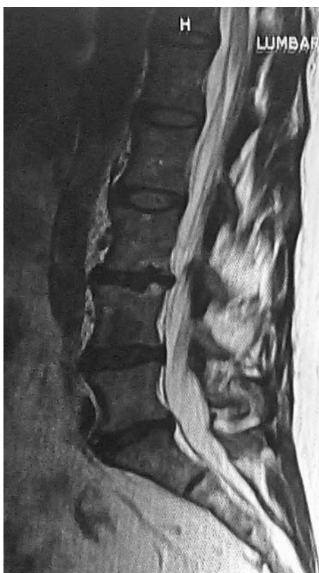
Figure 1. Magnetic resonance image showing lumbar degenerative disc disease with L3-4 stenosis.

had some degeneration at L4-5 and L5-S1. To ensure that the L3-4 level was the main pain generator, provocative discography was done with proximal and distal controls, confirming the L3-4 level as the primary pathology. We offered her either a minimally invasive transforaminal lumbar interbody fusion or a minimally invasive direct lumbar interbody fusion with posterior interspinous plating. The LLIF and plating were chosen.