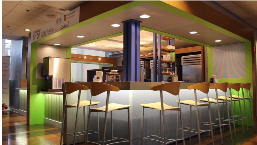
FIGURE 2 Framingham State Food Study kitchen.

items. Additional SAS programming allowed for automatic substitution of menu items in production sheets, according to the master list, with items that maintained the macronutrient composition of the meal. The food service team reviewed each production sheet before food preparation and flagged any meal that contained a substitute menu item. The flag was an additional alert for food service staff to be extra vigilant. This system maximized participant safety, without compromising differentiation between diets.