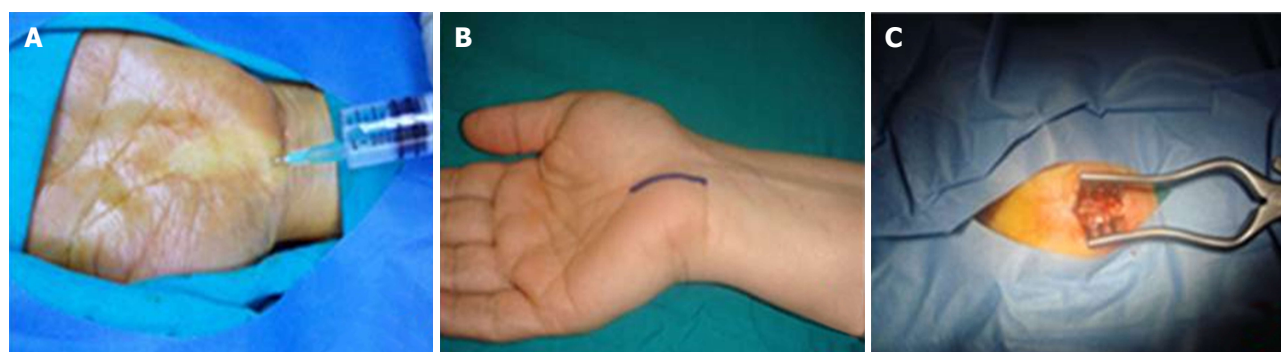
Figure 1 Mini open incision method. A: Local anesthetic application to the incision line; B: The standard incision starts from the distal volar wrinkle, passes between the thenar and hypothenar region 2-3 mm medially to thenar wrinkle and extends 2-3 cm distally to the lateral side of the third finger; C: Placement of the skin retractor after sharp dissection.

were discharged on the same day. An elastic bandage was used for the first 24 h and the arm was positioned in a 90° flexion. Postoperative wrist splinting was not used. The next day after the operation, dressings were changed and finger exercises were started. Stitches were removed on the 10 th day and exercises with a softball and hot water bath were initiated. The mean follow-up time was 8.6 mo (range: 7.2-13 mo).