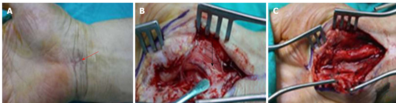
Figure 2 Extended mini-open incision technique in a patient previously operated on using the uniprotal endoscopic method. A: Endoscopic portal scar over the distal wrist wrinkle (red arrow); B: Incomplete incision of the transverse carpal ligament and compression on the median nerve (black arrow); C: The incision is completed and the median nerve is fully decompressed.