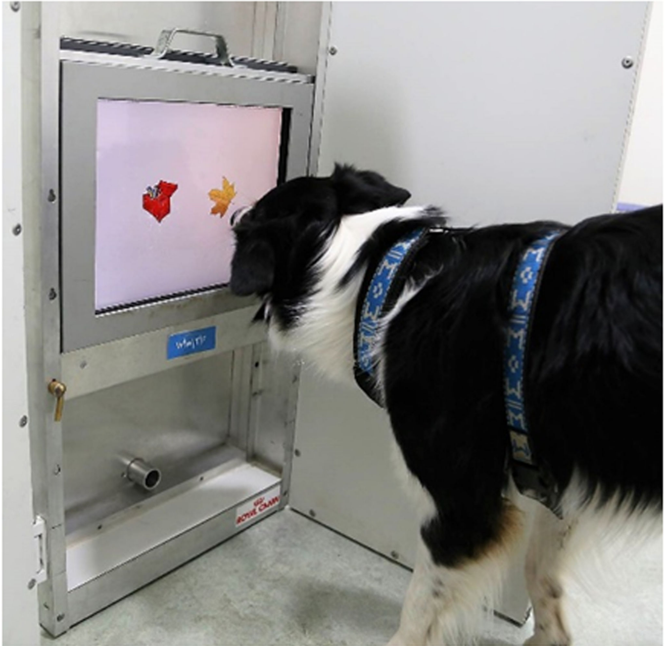
Figure 3. A Border collie working on the touchscreen in the two choice discrimination