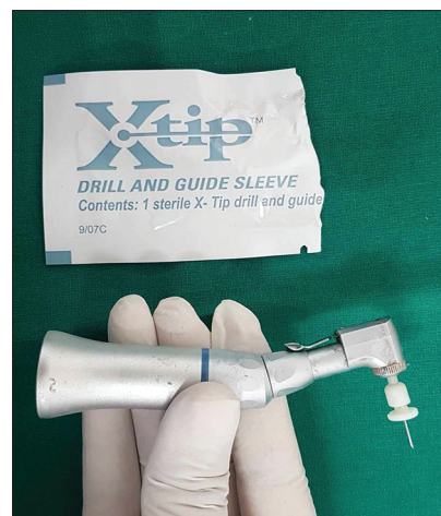
Figure 1: Armamentarium used for intraosseous local anesthesia: X-tip perforator attached to slow-speed handpiece

The guide sleeve along with a perforator tip was then attached to the slow speed handpiece with speed of 15,000–20,000 rpm [Figure 1]. Holding the drill at 90° angle to the point marked on the gingiva, the perforator tip was pushed and withdrawn in a forward and slow pecking motion using light pressure until a break-through feeling was felt or the tip penetrated completely in the cancellous bone. The perforator tip was then separated, and the guide sleeve was secured in place using a mosquito forceps or tweezers. A metal syringe loaded with X-tip® 27-gauge