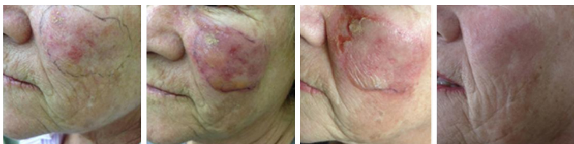
Figure 2 Clinical aspects at baseline, during and after ingenol mebutate treatment in a 71-year-old woman.

tolerated by patients, with reduction until disappearance of clinically visible AKs and resolution of lesion over one year. 24,32,33 Greater improvements were reported in face/scalp compared with trunk/extremities. 34