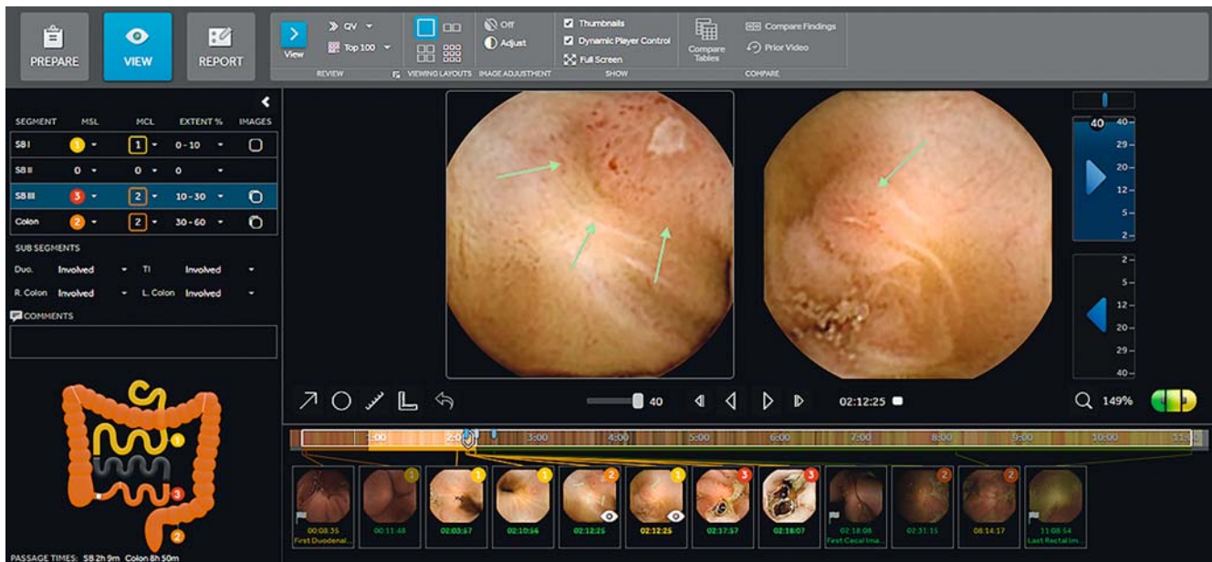
► Fig. 1 PillCam Crohn's system representative image of gastrointestinal table and map.

In recent years, a significant effort has been made to identify patients and categorize them into low versus high risk, and accordingly treat them step up or top down, as well as to explore the concept of achieving deep remission and mucosal healing [1]. Targets have been suggested by the international organization for IBD to achieve these goals: the treat to target concept [9].