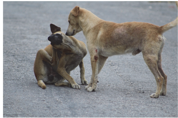
FIGURE 3: A male “malix” dog (standing) with good body condition (BCS 3) presenting a wound in the left former limb and diffuse alopecia in the thoracic region.

collected pooled samples. It is noted that eggs with the A. caninum parasite were most frequently found in areas with medium to high intensity of infection.