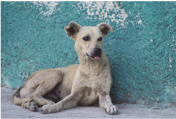
FIGURE 2: A typical “malix” free roaming male dog from San Francisco de Campeche.