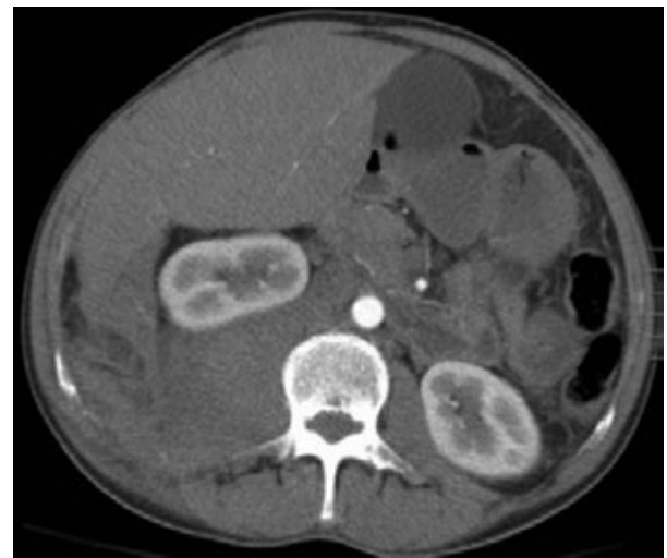
Figure 3. Large right retroperitoneal hematoma displacing right kidney superiorly.