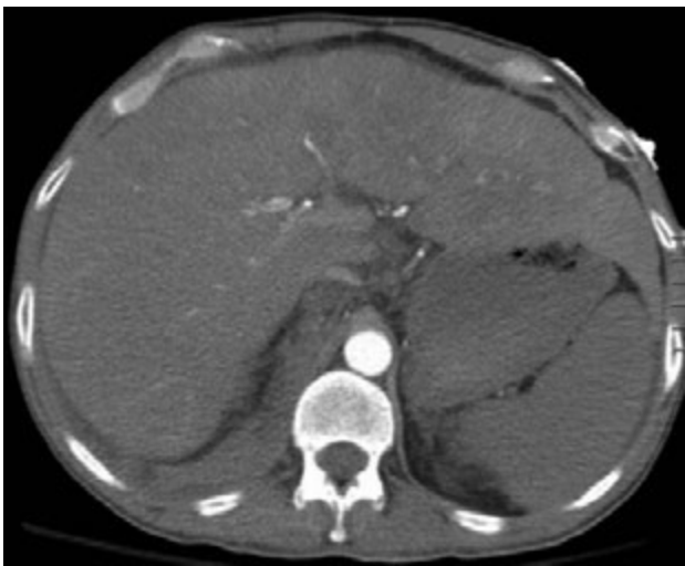
Figure 2. Massive hepatomegaly measuring 27.2 cm in craniocaudal dimension.