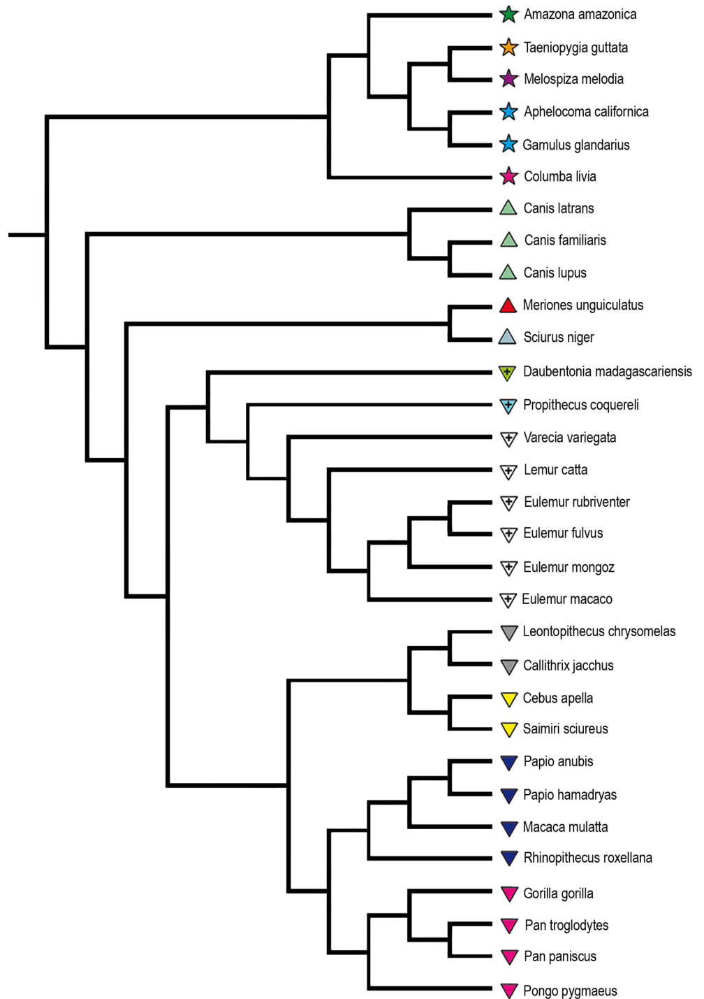
Fig 1. Phylogenetic tree of the 31 homeothermic species included in the analyses. Phylogenetic tree constructed with OneZoom Tree of Life Explorer [26], Timetree of Life [27], 10kTrees [28], and an estimated divergence date of 15 kya for gray wolves and domestic dogs [29]. Species names are shown on the branch tips.

included in the analysis, some outperformed others in the cognitive test. The offspring of the outperformers had longer rearing periods and therefore greater degrees of altriciality than did the offspring of the other species. As predicted by the altricial intelligence hypothesis, this finding suggests that such traits are evolutionarily related.