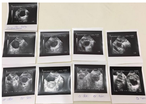
Figure 2: Ultrasound image report after the treatment

Figure 2 is shown ultrasound image done after the treatment showing the cysts are gone from both ovaries.