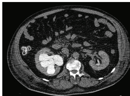
FIGURE 1: Abdominal-pelvic CT scan with endovenous contrast: right hydronephrosis with ipsilateral renal atrophy.

The bladder and the right ureter were gently separated from the spermatic cord. Without violating the urinary bladder wall integrity, the content of the hernial sac was reduced into the abdominal cavity. Hernioplasty was performed applying a polypropylene mesh, 10 \times 15 cm in size, by means of Lichtenstein's method. The postoperative period was uneventful. Five days after surgery, the patient was discharged from the hospital in good general condition. Patient follow-up, with clinical examination and ultrasound, at one month and one year did not reveal hernia recurrence neither urinary disorders.