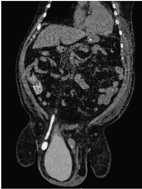
FIGURE 3: Abdominal-pelvic CT scan with endovenous contrast: right inguinal hernia, containing the whole urinary bladder and the right pelvic ureter dilated; coronal reconstruction.