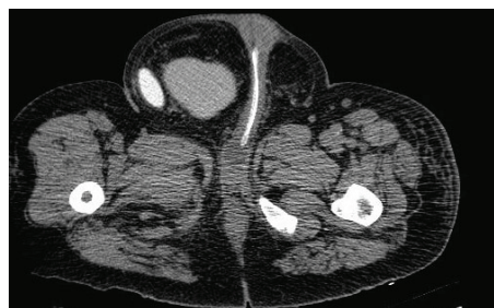
FIGURE 2: Abdominal-pelvic CT scan with endovenous contrast: right inguinal hernia, containing the whole urinary bladder and the right pelvic ureter dilated.