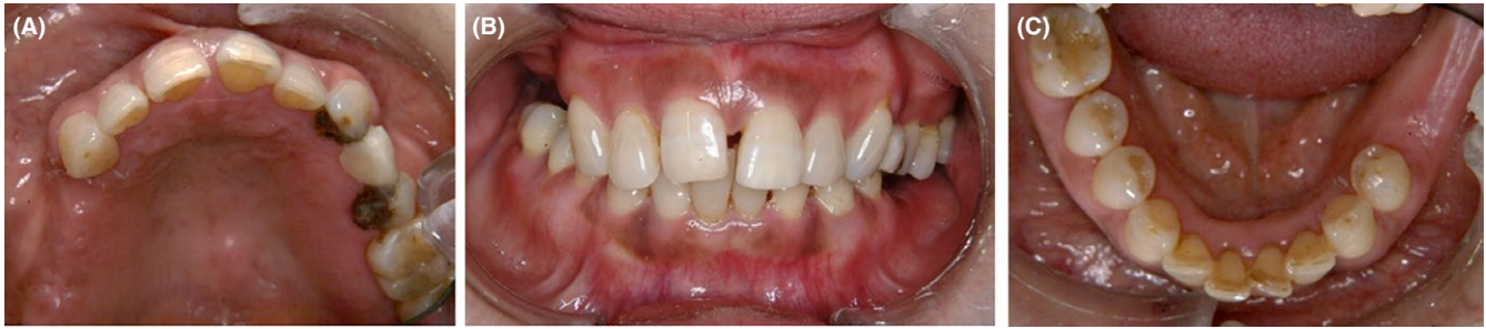
FIGURE 2 Clinical manifestation after the removal of dental prostheses. The all-metal dental restorations were removed and replaced with composite restorations (A-C)

using hybrid composite resin to replace metal fixed dental prostheses. The progress of the case was monitored and allergic symptoms on hands and feet improved gradually (Figure 2).