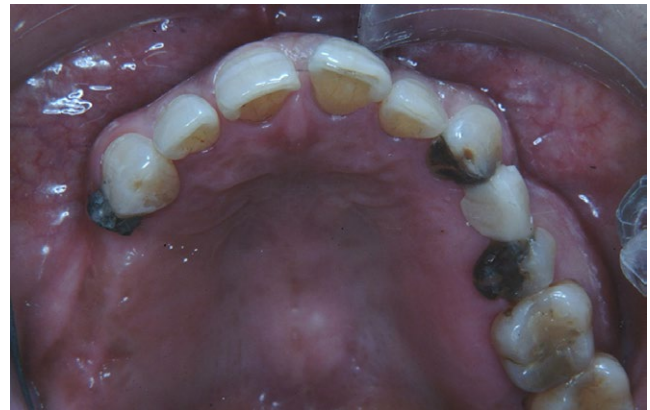
FIGURE 3 Titanium metal insert to check the allergic reaction. The small piece of Ti was cemented to the distal aspect of the maxillary right canine and observed for 6 mo

A two-stage implant placement protocol was undertaken. Firstly, the mandibular implants were placed. After healing, the maxillary implants were placed for the missing teeth. After a healing period of 4 months for mandibular implants and 6 months for maxillary implants, a second-stage surgery was performed for both the sites. Since the patient was not wearing any dental prostheses for her missing teeth, the natural teeth in the opposing arch (maxillary left first and second molars and mandibular right first and second premolars and first molar) were supra erupted. Therefore, to maintain the occlusal plane an intentional root canal treatment of the supra erupted teeth, followed by occlusal plane correction and composite resin restoration of the occlusal surface, was carried out. To achieve optimum crown length, surgical crown lengthening of the supra erupted teeth was performed in the