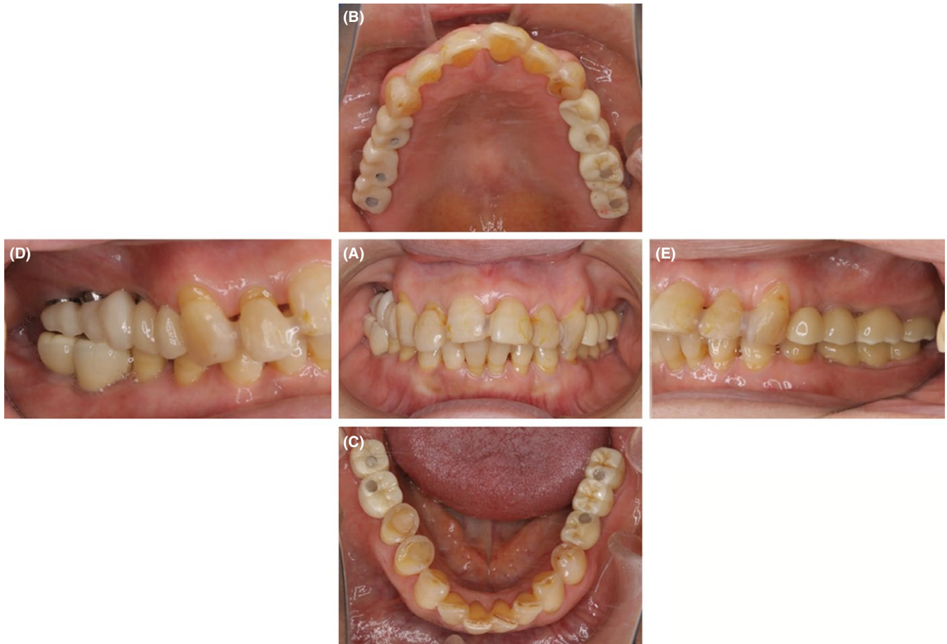
FIGURE 4 Full mouth rehabilitation of patient using dental implants and metal-free prostheses. The implant dentures were restored with provisional restorations. Patient reported improvement in her oral function after the completion of oral rehabilitation