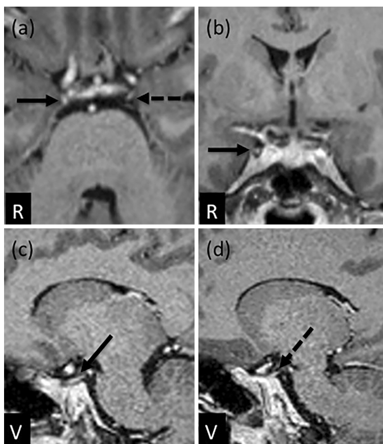
Figure 2. Gadolinium-enhanced T1-weighted magnetic resonance imaging: axial (a), coronal (b), and sagittal (c, d) views. The right oculomotor nerve was enhanced clearly in axial (a: arrow), coronal (b: arrow), and sagittal (c: arrow) views. The enhancement of the left oculomotor nerve was noted in axial (a: dotted arrow) and sagittal (d: dotted arrow) views. R: right, V: ventral

The neuroradiological findings in patients with THS include mass lesions in or dilatation of the cavernous sinus (13). In the present case, MRI showed the enhancement of both oculomotor nerves, although only the right oculomotor nerve was clinically affected. The enhancement was observed proximal as well as distal to the cavernous sinus and was more apparent in the right oculomotor nerve than in the left one. Although the number of reported cases is small, the abnormal gadolinium enhancement of cranial nerves on MRI has been reported in patients with MFS (14-18). Most of the reported enhanced cranial nerves were symptomatic; however, one study reported the enhancement of clinically silent cranial nerves in patients with MFS. Recently, Malhotra et al. reviewed 17 pediatric patients with MFS and reported that the gadolinium enhancement of clinically silent optic nerves was noted in 3 patients (18). This suggests that the MRI findings do not always correlate with the clinical manifestations of cranial nerve involvement in MFS cases (18). Alternatively, steroid treatment may have prevented the left oculomotor nerve from becoming clinically affected.