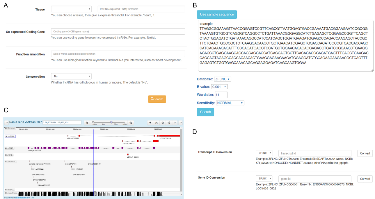
Figure 2. Usage of the database. (A) Filtering conserved functional lncRNA candidate through ‘Advanced functional lncRNA filtering’ function. (B) Finding zebrafish lncRNA through BLAST sequence similarity search. (C) Finding zebrafish lncRNA through sequence positions in GBrowser. (D) Converting IDs among diverse databases by using ‘ID Conversion’.

zflncRNpedia, the ‘ID Conversion’ module can assist in the ID switch into ‘ENSDART00000152494’ in Ensembl or ‘ZFLNCT00001’ in ZFLNC. Another scenario is that you only know the sequence of one lncRNA, but now, you can use ‘BLAST’ module to find this lncRNA in ZFLNC through sequence similarity (Figure 2B). For example, using ‘BLAST’ module, you can find human MALAT1 homolog in zebrafish, ZFLNCT12716. At last, if you only know the genomic location of one lncRNA, you can use ‘Gbrowser’ module to search the lncRNA in ZFLNC (Figure 2C). For example, you can find lncRNA ZFLNCT15181, which is a highly conserved lncRNA (PhastCons: 0.94), through the genomic location danRer7 chr18: 265 594–269 844.