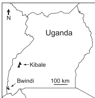
FIG 1 Map of Uganda (in East Africa) showing the locations of Kibale National Park (Kibale) and Bwindi Impenetrable National Park (Bwindi).

and nonlinear decrease in the proportion of resistant isolates with increasing local antibiotic prices ( r^2 = 0.68 ; t = -3.8 ; P = 0.007 ; Fig. 2), with the most expensive antibiotics (nalidixic acid and ciprofloxacin) associated with very low resistance proportions (0.8% and 0.4% of isolates, respectively).