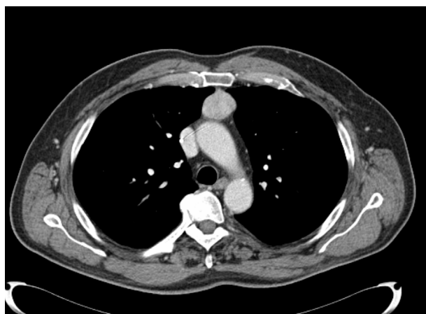
Figure 5 Chest CT scan (mediastinal window) showing small middle-mediastinal thymoma.