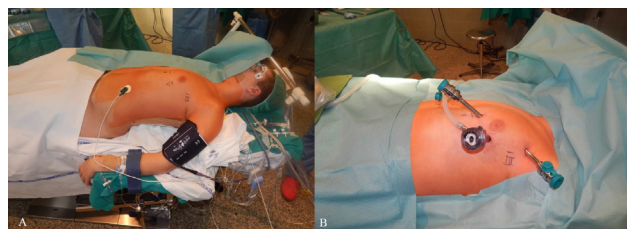
Figure 2 Patient and ports positioning.

field should always be prepared and draped for an eventual conversion to median sternotomy. A camera port for the three-dimensional 0° or 30° stereo endoscope is introduced through a 15 mm incision on the fifth intercostal space on the midaxillary line and two additional thoracic ports are inserted: one on the third intercostal space on the midaxillary region and another on the fifth intercostal space on the midclavicular space (Figure 2B). Two arms of the da Vinci system are then attached to the two access points and another arm is attached to the port-inserted endoscope (Figure 3). The left arm has an EndoWrist (Intuitive Surgical, Inc.) instrument that grasps the thymus; the right arm has an Endo-dissector device (Intuitive Surgical, Inc.) with electric cautery function (or a harmonic ultrasound dissector) used to perform the dissection. During surgery, the hemithorax is inflated through the camera port with CO 2 , ranging in pressure from 6 to 10 mmHg. When a left-sided approach is performed (this is our preference), the dissection starts inferiorly at the left pericardiophrenic angle and continues along the anterior border of the phrenic nerve. All anterior mediastinal tissue, including fat, is isolated from