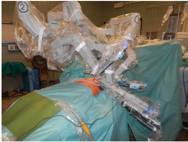
Figure 3 Patient-side cart with robotic arms introduced through the ports.