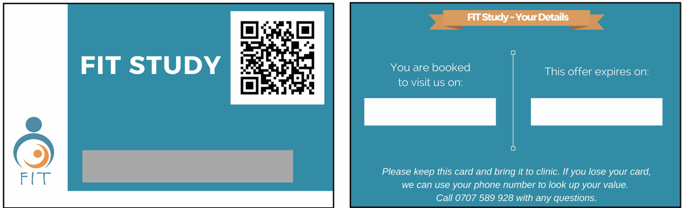
Figure 3 Randomisation scratch card before randomisation arm reveal. FIT, Financial Incentives to Increase Uptake of Pediatric HIV Testing.

allocation arm will be requested from the statistician who conducted the randomisation.