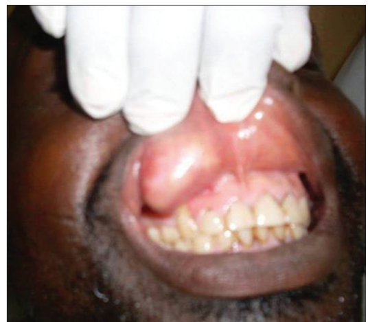
Figure 2: Intraoral clinical photograph