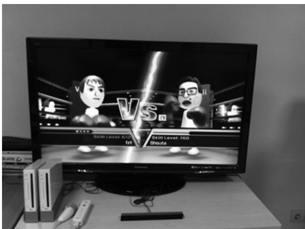
Fig. 2. Virtual reality exergaming equipment.

Much is known about the decreasing effects of physical exercise on pain related to musculoskeletal system at shoulder region. 6,8,18–20 Andersen et al 19 stated that special exercise programs given 2 days/week reduce pain in women with severe neck and shoulder pain problems. Parallel to the literature, it is found that exercise is a good solution to reduce pain. Both home exercise program and virtual reality exergaming reduces pain during activity and night at short term (before–after treatment) and long term (1 month follow-up). Virtual reality exergaming has increased the perception of the shoulder joint due to the increase in body