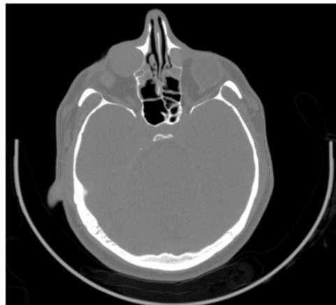
Figure 2. Pretreatment-computed tomography of the sinuses demonstrates bilateral dacryocystoceles greater on the right than left.

Based on these findings, he was then taken to the operating room for a bilateral endonasal decompression of dacryocystoceles and a right maxillary antrostomy. An endoscopic approach was favored due to the