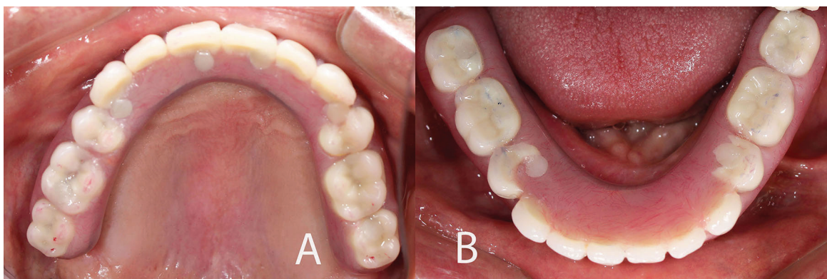
Fig. 3: Occlusal views of both restorations at insertion.