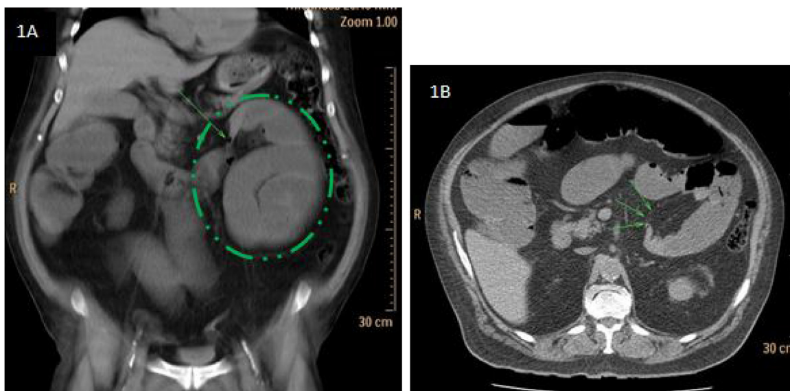
Fig. 1. A and 1B: CT scan shows dilated small bowel loops with transition zone located left to the Treitz ligament (green arrow) and saclike appearance (green circle).