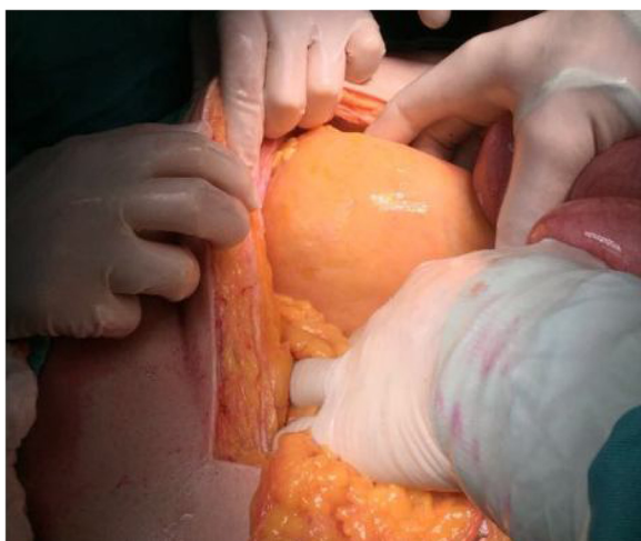
Fig. 2. Intra-operative photograph showing the hernia sac in Landzert fossa posterior to the descending mesocolon that contains dilated small bowel loops.