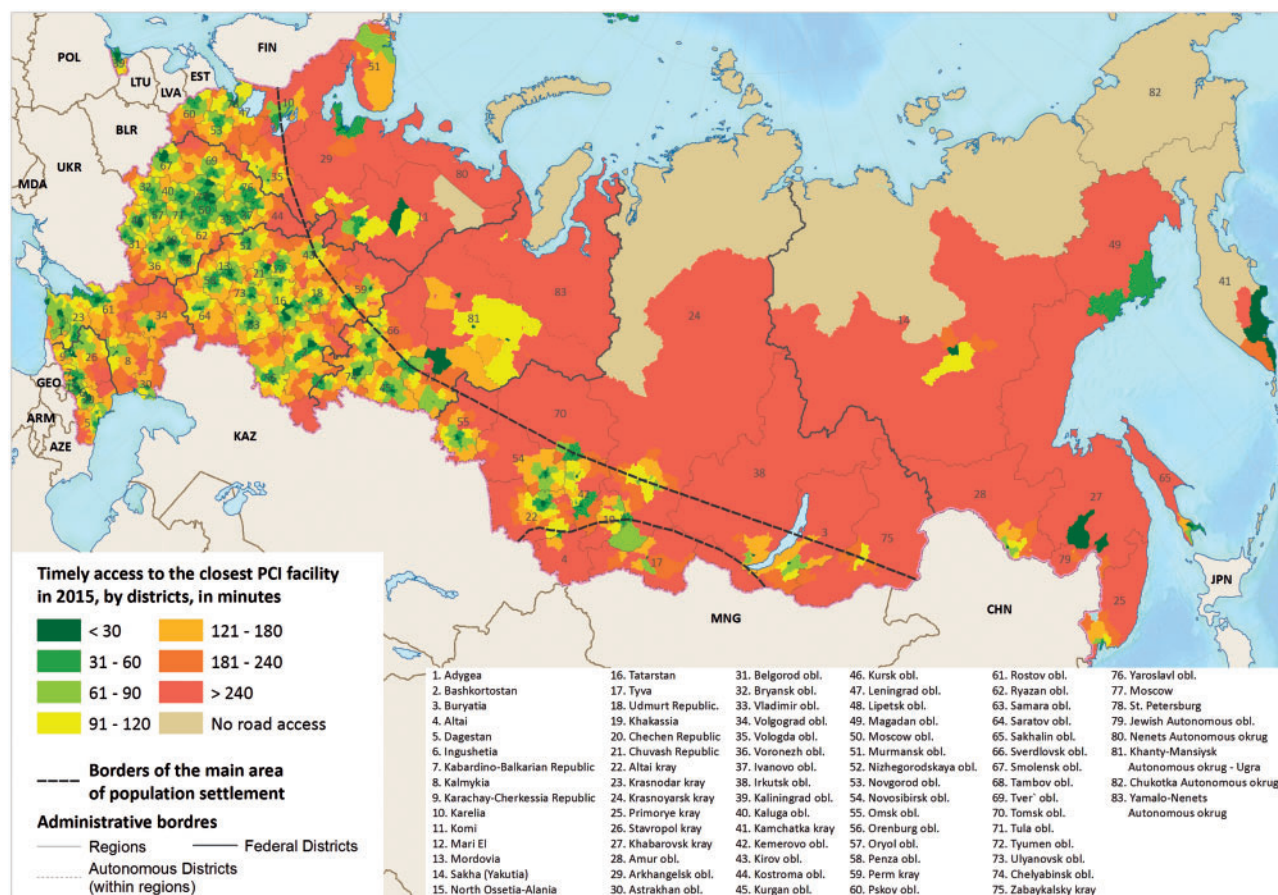
Figure 2. Driving times to the closest PCI facility in Russia in 2015.

The results shown so far have estimated travel times to the nearest PCI facility regardless of which region it was in. However, the financing and delivery of health care are largely devolved to the regions, so patients will normally be treated in the region in which they reside. For some people, the obligation to be treated in their home region might increase travel times compared with going to a facility that is closer but in another region. Consequently, we undertook a sensitivity analysis to compare differences in travel times to the nearest PCI facility in the same region or to the nearest facility wherever it is. This showed that, in 2015, 7 441 200 people or 11% of the population aged 40+ years lived in 400 bordering districts where it would be faster to go to neighbouring regions for treatment. For another 231 500 people who lived in 15 districts, PCI facilities are located only in neighbouring regions (Supplementary Figure 3, available as Supplementary data at IJE online). However, this option is associated with a relatively small increase of about 0.5% (337 690 people) in those who would live within 60 minutes' travel time and 2.3% (1 456 130 people) within 120 minutes' travel time.