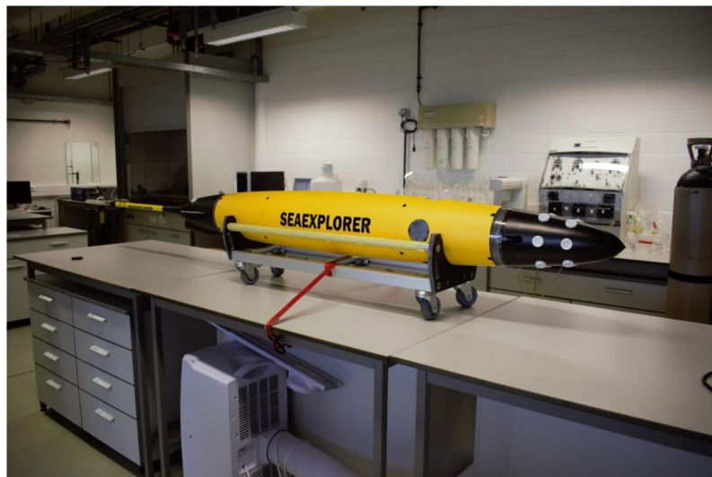
Figure 1. View of the modified SeaExplorer glider.

metals, microorganisms may also have receptors that target entire metal-ligand complexes, which is not dependent on dissociation of the complex before uptake, such as Ton B dependent receptors 13,14 .