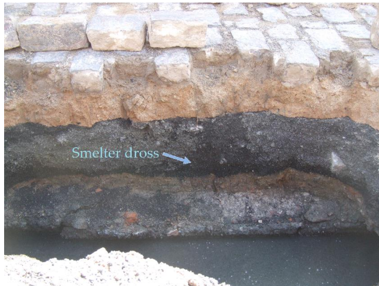
Figure 2. The smelter dross layer under the street pavement, 2008.