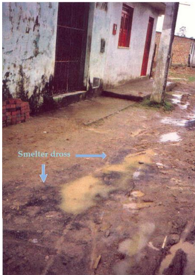
Figure 4. The dross polluting soil in front of households, 1998.