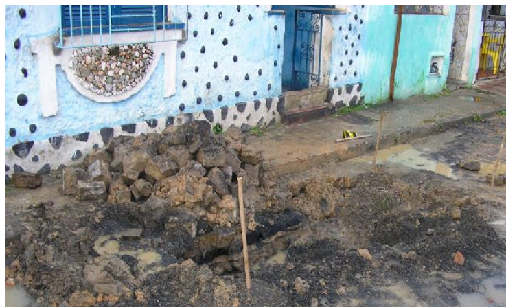
Figure 3. The dross exposed during water pipe repair, 2005.