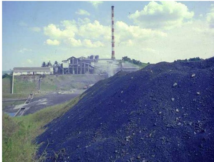
Figure 1. The big dross pile on the smelter ground, 1999.