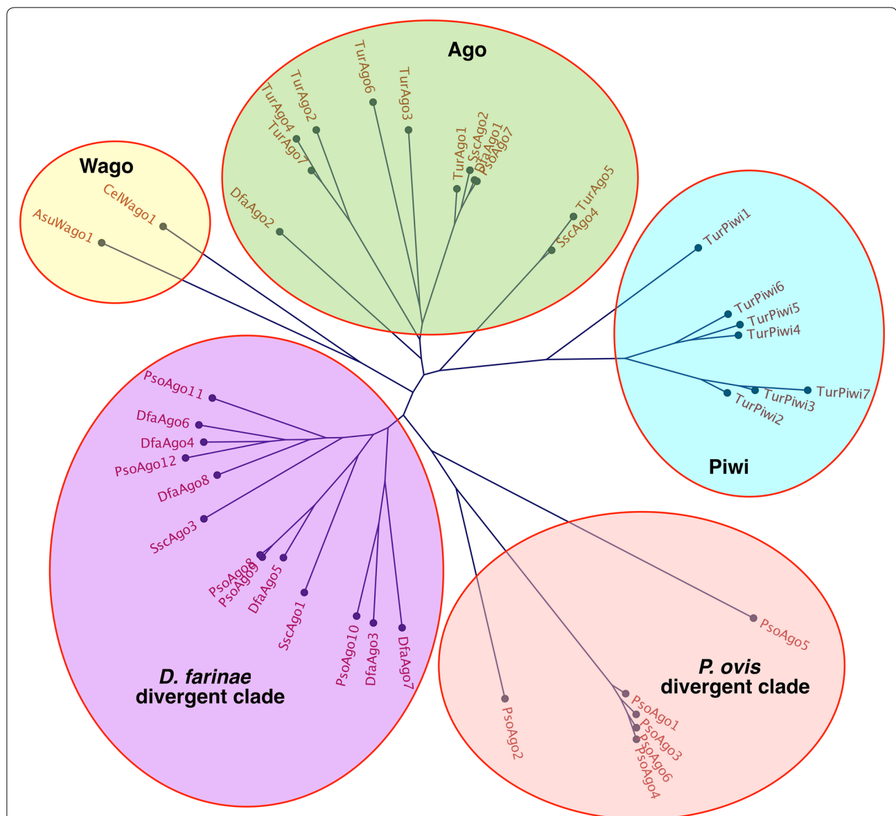
Figure 1 Phylogenetic sequence analysis of P. ovis argonaute proteins reveals loss of piwi-clade argonautes within Psoroptes ovis . S. scabiei Ago proteins: SscAgo1 (KPM04840.1); SscAgo2 (KPM09009.1); SscAgo3 (KPM04151.1); SscAgo4 (KPM09008.1). T. urticae Ago proteins: TurAgo1 (tetur20g02910); TurAgo2 (tetur09g03140); TurAgo3 (tetur09g00620); TurAgo4 (tetur02g10560); TurAgo5 (tetur02g10580); TurAgo6 (tetur04g01190); TurAgo7 (tetur02g10570). T. urticae Piwi proteins: TurPiwi1 (tetur06g03300); TurPiwi2 (tetur28g00450); TurPiwi3 (tetur28g00340); TurPiwi4 (tetur06g05570); TurPiwi5 (tetur06g05580); TurPiwi6 (tetur06g05600); TurPiwi7 (tetur17g03380). D. farinae Ago proteins: DfaAgo1 (AUI38415.1); DfaAgo2 (AUI38416.1); DfaAgo3 (AUI38417.1); DfaAgo4 (AUI38418.1); DfaAgo5 (AUI38419.1); DfaAgo6 (AUI38420.1); DfaAgo7 (AUI38421.1); DfaAgo8 (AUI38422.1). P. ovis Ago proteins: PsoAgo1 (psovi14g07720); PsoAgo2 (psovi14g07690); PsoAgo3 (psovi14g07700); PsoAgo4 (psovi14g07730); PsoAgo5 (psovi63g00040); PsoAgo6 (psovi14g07710); PsoAgo7 (psovi295g00210); PsoAgo8 (psovi280g02500); PsoAgo9 (psovi280g02490); PsoAgo10 (psovi26g02770); PsoAgo11 (psovi294g02030); PsoAgo12 (psovi302g00450). C. elegans Wago-1 (CelWago1: Q21770-1); Ascaris suum Wago-1 (AsuWago1: F1L7U8-1).

by the Dicer processing of dsRNA. Furthermore, homologous sequence to RNA-directed RNA Polymerases (RdRP) Ego-1 and Rrf-1 were detected. These are considered essential for the amplification of dsRNA-induced RNAi in C. elegans and the thale cress plant Arabidopsis