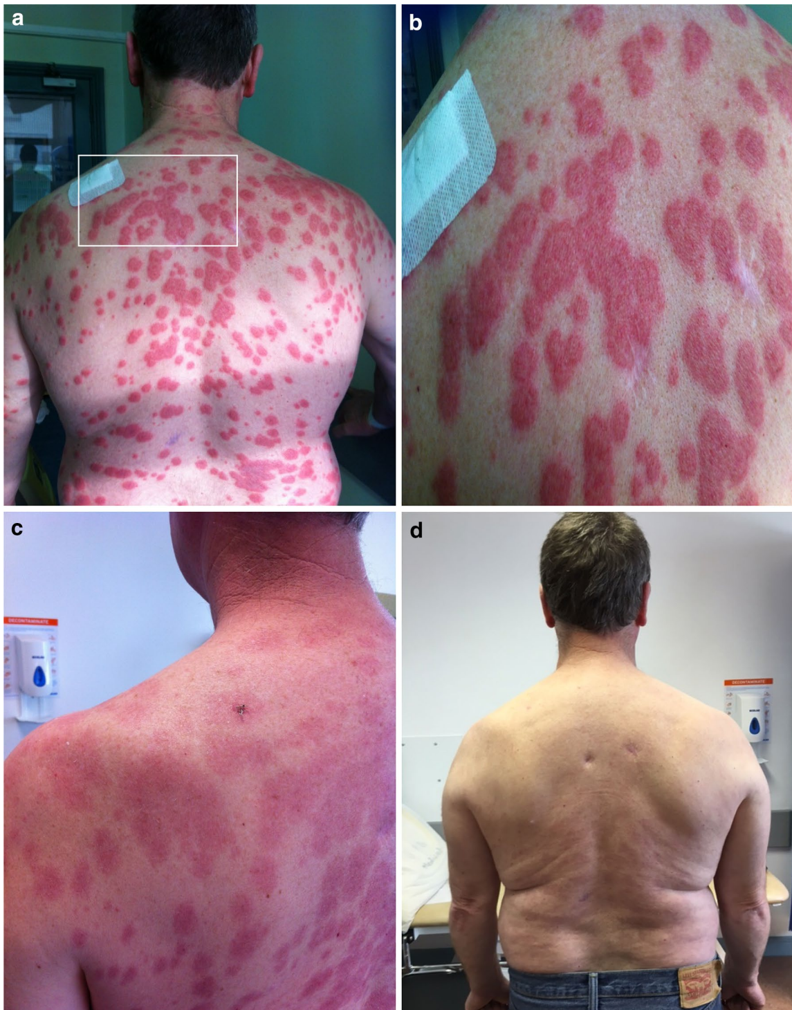
Fig. 1 a Abrupt onset of disseminated painful skin lesions. b Target lesions visible with areas of confluence. c After 2 weeks of steroid therapy and AZA withdrawal. d After 4 weeks of steroids and addition of colchicine

of drug-induced Sweet syndrome. His steroid dose was tapered gradually to zero and treatment with colchicine was continued. As of August 2017, his vasculitis remains