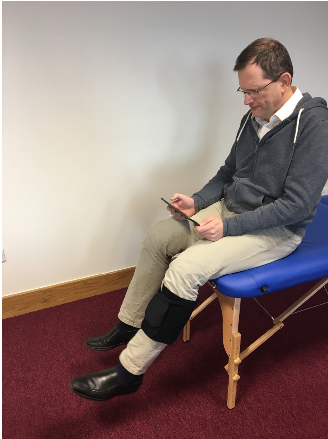
Figure 1 User setup of biofeedback system with single inertial measurement unit placed on the shin and associated tablet application (written consent provided for use of image).