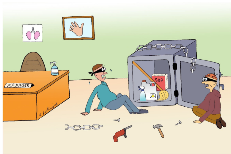
Fig. 4 Hospitals should value environmental hygiene cleaning and maintenance