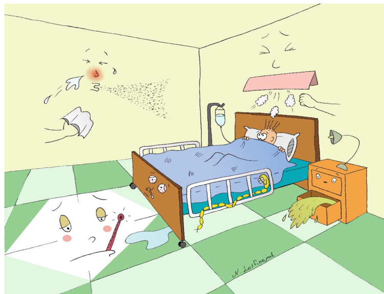
Fig. 1 “No one wants to stay in a contaminated room”

Although high-quality interventional studies are limited, there are enough to show that cleaning and disinfecting hospitals in order to prevent infection works. Analysis of numerous studies shows a clear correlation between “cleaning hygiene failures” and the number of intensive care unit-acquired infections (Fig. 2). Several studies showed that patients were much more likely to contract certain pathogens if the patient in the room before them was colonized or infected with a pathogen