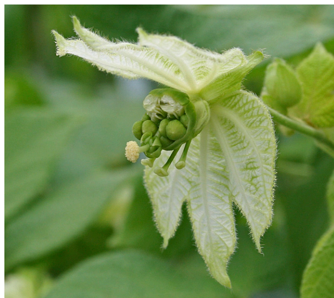
Fig. 2. Blossom inflorescence of D. scandens with the first (terminal) male flower open above the three female flowers. In this species, the shortest distance between anthers and the stigmas affects the outcrossing rate.

We found no indications of incompatibilities between populations ( SI Appendix, Table S9 ). In both datasets, size differences between seeds resulting from interpopulation crosses and those resulting from within-population (maternal) outcrossing were best explained