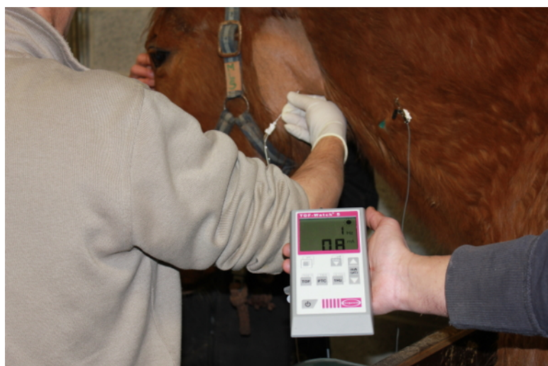
Figure 2: Setting during the injection of the stem cells. The nerve stimulation needle is introduced on the left side of the larynx and directed toward the left recurrent laryngeal nerve. The nerve stimulator is set at 0.8 mA. Please click here to view a larger version of this figure.