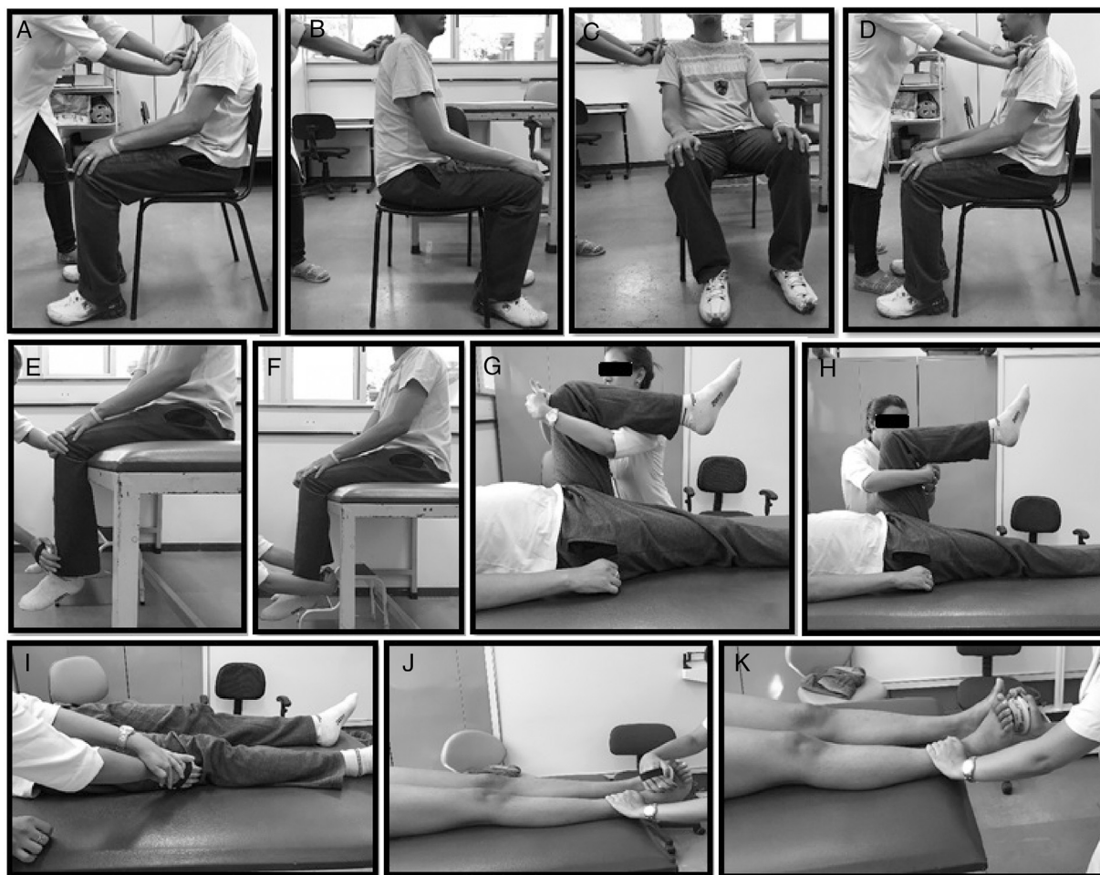
Figure 1 Measurement of muscle strength with the hand-held dynamometer. (A) Trunk flexors; (B) trunk extensors; (C) lateral trunk flexors; (D) lateral trunk rotators; (E) knee extensors; (F) knee flexors; (G) hip flexors; (H) hip extensors; (I) hip abductors; (J) ankle dorsiflexors; (K) ankle plantarflexors.