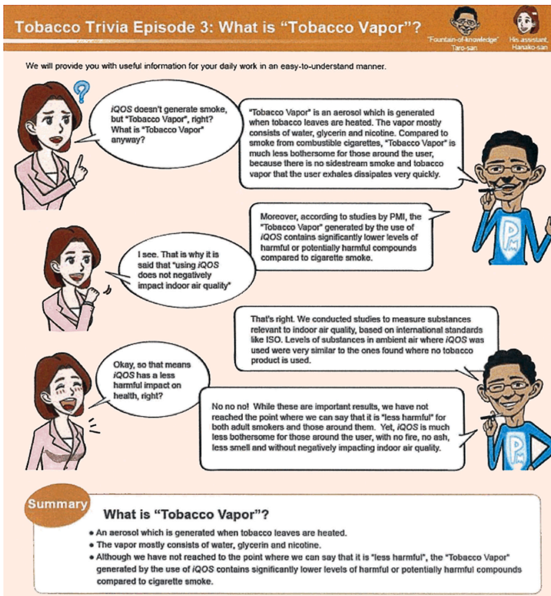
Figure 2 Excerpt from an internal October 2015 Philip Morris Japan newsletter. To clarify employee understanding of IQOS, a mock employee asks: ‘... iQOS has a less harmful impact on health, right?’ The company expert replies, ‘No no no! While these [ambient air reductions] are important results, we have not reached the point where we can say that it is “less harmful” for both adult smokers and those around them.’ 74