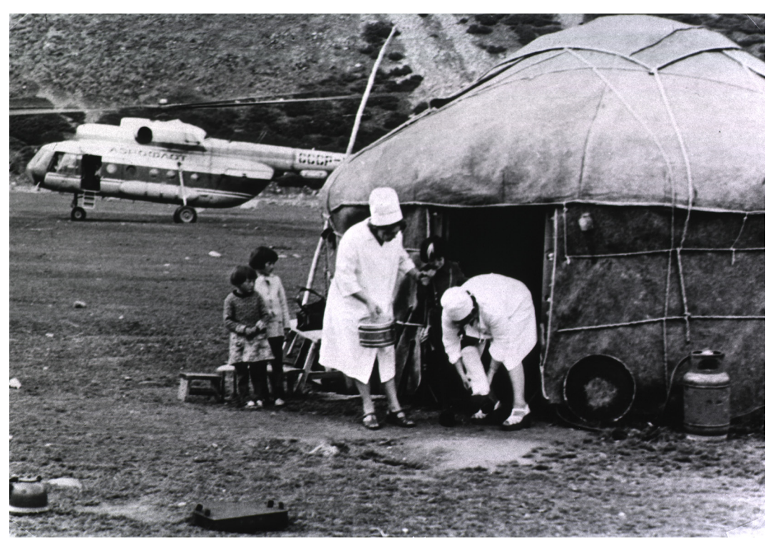
Figure 2 A helicopter sits in the background as two medical nurses treat a patient outside the entrance to the tent of a nomadic family, Kazakhstan, USSR, 1978.

you can see for yourself what great achievements the peoples of former underdeveloped backwaters of Tsarist Russia have achieved in the field of peaceful industrial construction, in science and technology, in culture and arts, in the protection of public health.