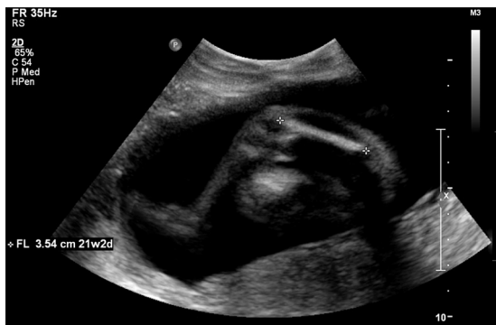
Figure 1. Prenatal ultrasound at 22 6/7 weeks gestational age demonstrates short femurs measuring 3.5 cm (< 2.5%).

low, flat palate; hypertrichosis of the bilateral temporal region; and light hair colour that was atypical for his ethnic background. He exhibited diffuse patchy ecchymoses on the trunk and persistent thrombocytopenia as well as hyperbilirubinaemia. Echocardiogram showed a small atrial septal defect and a large patent ductus arteriosus. The infant also experienced respiratory distress, requiring continuous positive airway pressure ventilation.