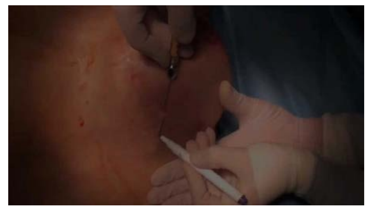
Video: Movie of the fat graft injection performed by Gentle Technique in patient affected by outcomes of breast reconstruction

Then the graft was injected through periareolar entrances located at 45^{\circ} -135° and 225^{\circ} -315° on the areolar circumference. If required, we place an additional third access at 12 o'clock. The fat was injected using 1–2 cc syringes through three or four tunnels arranged radially around the skin access and released with a retrograde technique while withdrawing the cannula along linear deposits within and over the mammary gland. We generally use an inferior number of tunnel for these access then the number we used for the inframammary ones because this graft is not used to fully the breast but just to refine breast contour and skin irregularities. The quantity of fat injected through these accesses is about 50–70 cc, according to the breast needs.